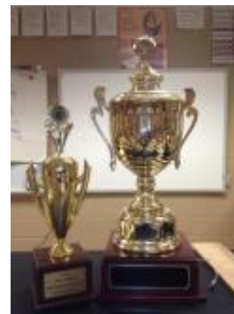
The Kane Cup